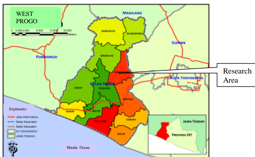
Figure 1. Research area in West Progo administration map [1].

influenced by the geological conditions in an area, for example in terms of the type of rock [4]. This groundwater chemical aspect will support hydrogeological research of a region. Hydrogeological research has been developed in various regions to assist the society for their water supply. Water is a very vital and basic needs, so that it must be kept in sufficient quantity and good quality.