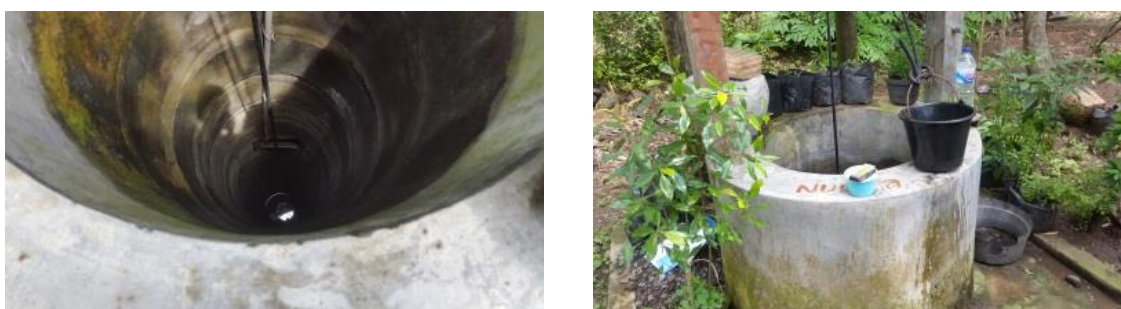
Figure 3. A well in Ngentak, Banjararum that has been sampled for chemical laboratory work.

Groundwater samples used for chemical laboratory analysis were taken in one well and three springs (Figure 3). The physical/chemical properties can be read in Table 2.