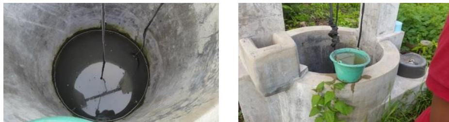
Figure 2. Well in Ngipikrejo, Banjararum has less quality of groundwater.

Field observation showed physical properties of groundwater as clear / colorless, tasteless and odorless, with low turbidity one. Ten locations has been sampled and only groundwater in Ngipikrejo that showed less transparent, slightly smelly and slight turbid (Table 1; Figure 2).