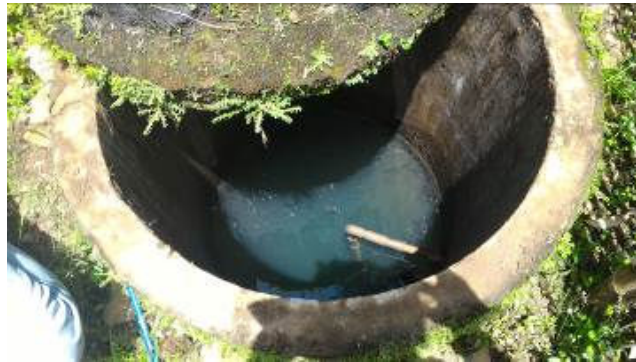
Figure 4. Water condition of Blekokan Well. It has been taken for sample 1.

The springs in Jolotundo have somewhat turbid water, emerging from the breccias on the south bank of the river (Figure 5). This eye comes from the pyroclastic brecciation aquifer, grayish-gray, gravel – boulder fragment-size, open-packed, bad sorting, jointed (Fig. 6).