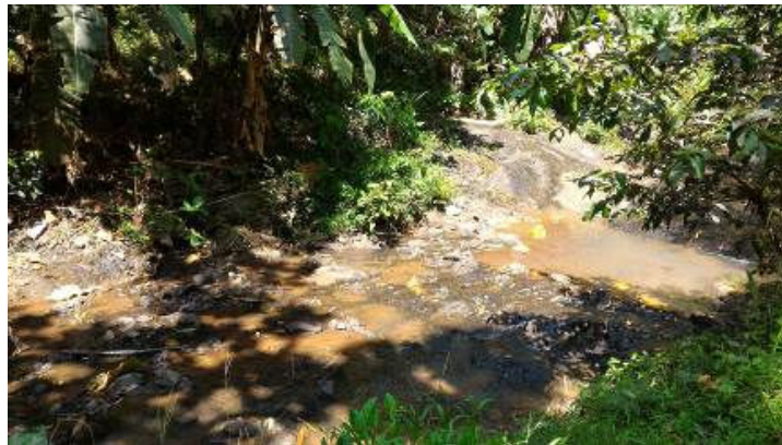
Figure 6. Aquifer at Jolotundo spring and surrounding area.

The isotope test results from groundwater samples studied showed a variation of stable isotope content values of O-18 and D (Table 2). Clearly visible variations are found on the content of the O-18 isotope, where there is a fairly mild content in Blekokan (O-18 = -6.9 ‰), whereas groundwater in Jolotundo springs has a heavier O-18 isotope (O-18 = - 4.15 ‰).