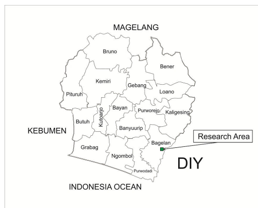
Figure 1. Research area at western part of West Progo Dome.

The need for water for the community can be obtained from surface water and groundwater. Surface water can be obtained from rivers, lakes, marshes or seas. Nowadays, surface water is sometimes polluted so groundwater becomes a better alternative to meet the life needs of water. Therefore, the potential of groundwater in an area needs to be assessed so that we can provide water in sufficient quantity and good quality.