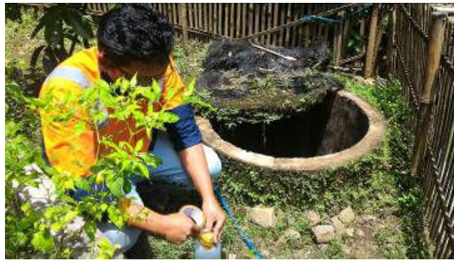
Figure 3. Blekokan well seen from near distance.

Two groundwater samples for isotope testing have been taken from Blekokan well and Jolotundo spring. The water at Blekokan wells usually has clear water, but when it comes to rain it can turn into turbid (Fig. 3 - 4). According to the information of the inhabitants, this well water only fluctuates but never stopped, with groundwater face only 1 m at the time of sampling.