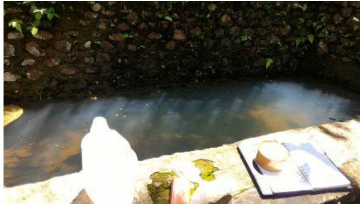
Figure 5. Jolotundo spring; the water seems rather turbid caused by precipitation several days before sampling. (Sample 2).