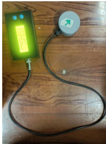
Figure 2. Prototype of IoT Sensor Test System for Building Movement Monitoring

The average error value of 1.58% indicates that the MEMS sensor is capable of measuring microdeformations with high accuracy, making it suitable for use as a key component in an IoT-based SHM system.